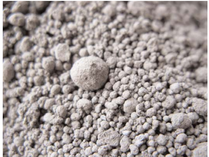
Figure 4. Pelletized lime can be applied with either a drop or rotary spreader.