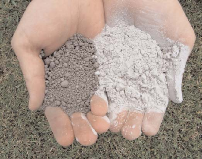
Figure 2. Comparison of pelletized lime (left) and pulverized limestone (right).

Liming materials with a fine particle size such as pulverized limestone may be difficult to distribute accurately with a rotary spreader but can be more easily distributed with a drop spreader (Figures 2 and 3). Lime can be pelletized so that many small particles are bonded together, which allows the product to be more easily applied (Figure 4). Pelletized liming materials can be distributed with a rotary spreader or a drop spreader.