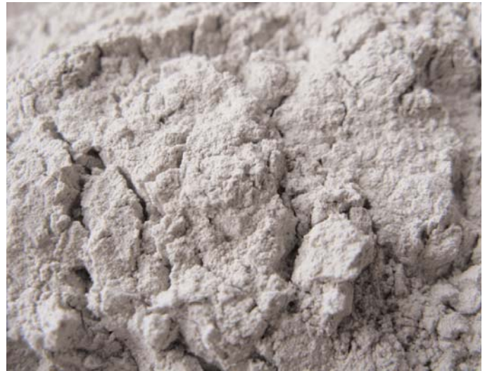
Figure 3. Pulverized limestone has a very fine texture and is more easily applied with a drop spreader.