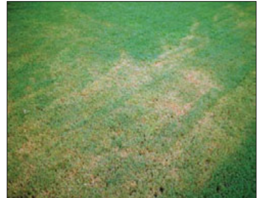
Figure 1. Thin and yellow rust-infected turf areas

In Arkansas, symptoms usually become visible in mid to late summer. The early symptoms of rust infection will often appear as irregular light-yellow colored areas ( Figure 1 ). Infections usually begin in shady, wet locations or anywhere the lawn may be stressed. Walking through infected areas will often leave an orange-brown dusting on your shoes. Close examination of individual yellowed leaves will show the presence of raised brick red to yellow-orange colored “pimples” or pustules that are scattered over the leaf surface ( Figure 2 ). These pustules contain very small spores that can become wind-borne and are responsible for spreading the fungus to other locations. Rust pustules usually appear on the leaves first and then spread to the stems. When infection is severe, these powdery spore masses can easily rub off on shoes or fingers, giving them a brown, dusty color. Heavily infected lawns will often develop thin areas, and death of the grass is possible during severe infections. These affected areas are more susceptible to winter damage. Symptoms tend to be especially visible during drought stress conditions or when grass is growing slowly.