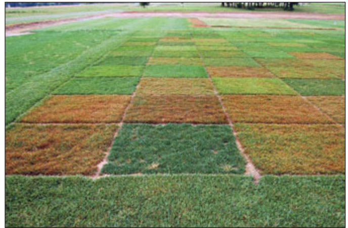
Figure 3. Difference in rust susceptibility among Kentucky bluegrasses

Management efforts should focus on both cultural and chemical methods. The most important cultural control is to select species and cultivars with good resistance to rust pathogens ( Figure 3 ). Typically, rusts are less of a problem on tall fescue ( Festuca arundinacea ), bermudagrass ( Cynodon spp.) and zoysiagrass ( Zoysia spp.) turfs. Kentucky bluegrass and perennial ryegrass are more susceptible to rusts in Arkansas. When planting a cool-season lawn, make sure not to use more than 10 percent perennial ryegrass ( Lolium perenne ), 10 percent Kentucky bluegrass ( Poa pratensis ) or 10 percent hybrid bluegrass in a mixture with tall fescue. Additionally, it is important to select cultivars with low susceptibility to rust pathogens ( Table 1 ) if the intended area is low maintenance or you anticipate using a reduced nitrogen fertility program.