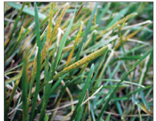
Figure 2. Rust pustules on leaves